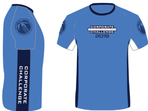
2019 CORPORATE CHALLENGE / UNISEX